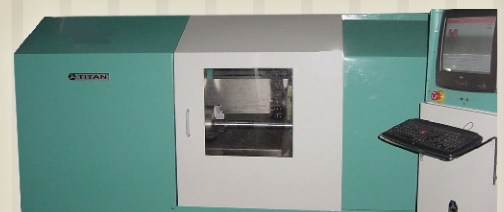
CNC LATHE MACHINES

With Various Range of CNC Machines, We Provide You With Cost Control, Quality and Extended Support.