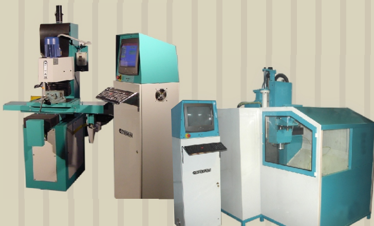
CNC MILLING/MACHINING CENTERS