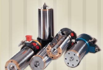
HIGH FREQUENCY SPINDLES

With Various Range of CNC Machines, We Provide You With Cost Control, Quality and Extended Support.