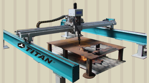
CNC FLAME/PLASMA/LASER CUTTING