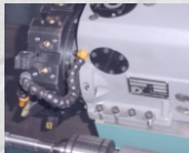
Bi Directional turret

Both X and Z-axis motors transmit power to the precision ballscrews. Positioning encoders are directly coupled to the ends of the servo motor for high precision positioning accuracy.